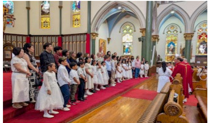
Children's Confirmation and first Holy Communion