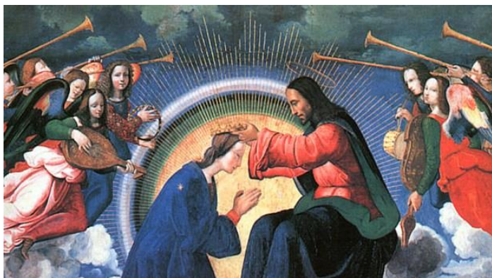
Queenship of the Blessed Virgin Mary (Celebrated August 22)

Eternal Rest Grant to Them, O Lord And Let Perpetual Light Shine upon Them