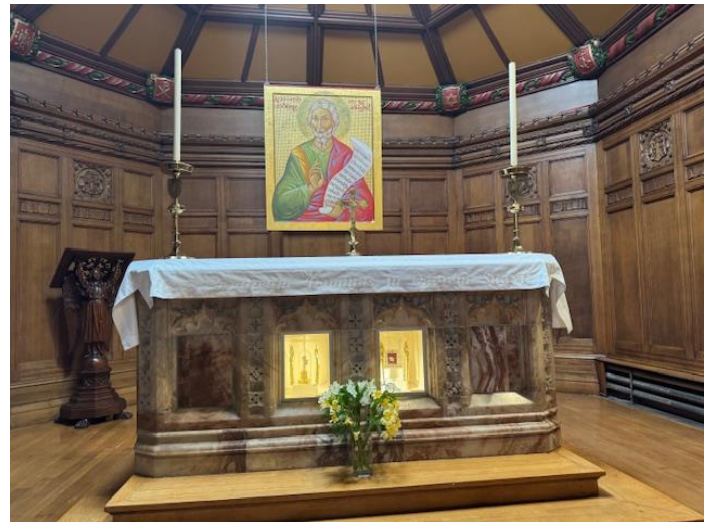
The relics of St Andrew at St Mary's Edinburgh. A former parishioner holidaying there sent this picture with a prayer.