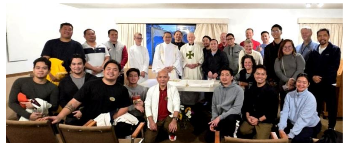
Stella Maris Ministry for Seafarers – Mass for Seafarers (July 11, 2025, Memorial of St. Benedict) at Edelweiss Club

Could we each find a unique role to play in our own Church, our own path to holiness? A place where we can pray our busy-ness aside and, like St Paul, rejoice as we act for Jesus?