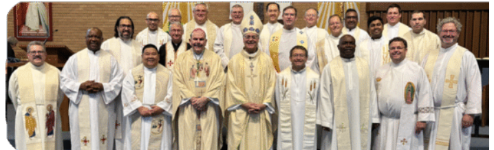
Canadian Federation of Presbyteral Councils (CFPC) group photo