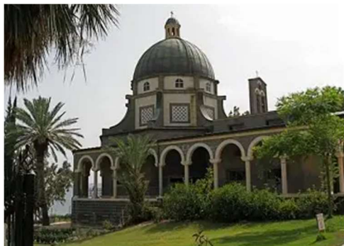
Church of the Beatitudes Galilee. Built in 1938 and octagonal to represent Jesus' 8 beatitudes